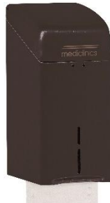
DTH100B Matte black finish