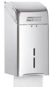
DTH100CS Satin finish