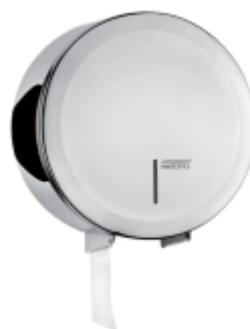
PR2789C Bright finish