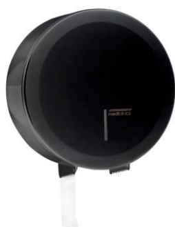
PR2789B Black epoxy finish