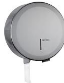
PR2789CS Satin finish