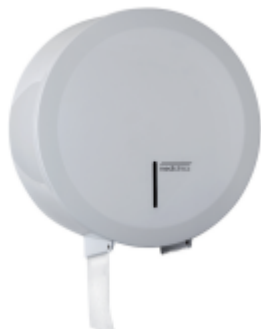
PR2789 White epoxy finish