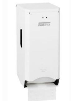
PR2784 White epoxy finish