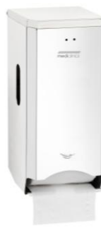
PR2784C Bright finish