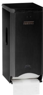
PR2784B Black epoxy finish