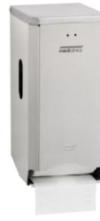
PR2784CS Satin finish