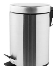
PP1303CS/PP1305CS/PP1312CS/PP1321CS Satin finish