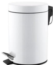
PP1303/PP1305/PP1312/PP1321 White finish