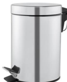
PP1303C/PP1305C/PP1312C/PP1321C Bright finish